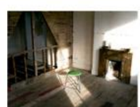
D3. 'Safehouses' a venue for filming, photography and events set up and run by www.maverickprojects.co.uk