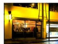
C7. Peckham Refreshment Rooms, a new restaurant critically acclaimed in the national press.