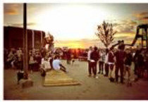
B2. Bold Tendencies' Summer Sculpture Park on top of the multi storey car park, half a million visitors since 2008.