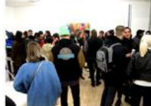
C6. The Sunday Painter, an art gallery space showcasing emerging and mid-career artists.