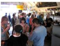
C3. Bar Story now frequently appears in the media as a significant part of the 'hotspot' reputation.