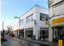
C5. Art deco building 12-16 Blenheim Grove, including Muana London a Sierra Leone community restaurant hub.