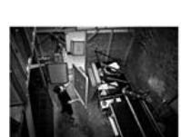
C8. Peckham Print Studio is a community membership screen printer, helped by TSP to set up in the arches behind the building.