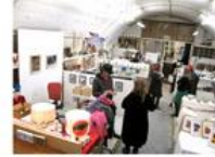
C1. Long established Arches Studios in Blenheim Court with 19 artisans' workshops teaching making skills.