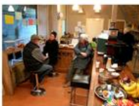
C9. Barry's Deli on Station Way, in an arch restored to its 1930's fittings and returned to a café delicatessen.