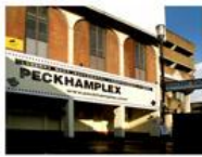
B1. Much loved PeckhamPlex independent cinema, catering to a variety of local needs.