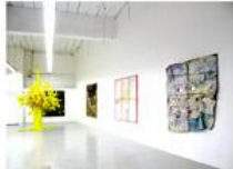
C11. Hannah Barry Gallery now at 4 Holly Grove is a major contributor to Peckham's creative 'hotspot' reputation.