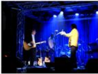
A1. Peckham Liberal Club, rescued by community action from demolition, is a historic social and entertainment venue.