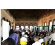
C10. The Old Waiting Room rescued by the community. The plan is to seek a community lease for business venue hire.