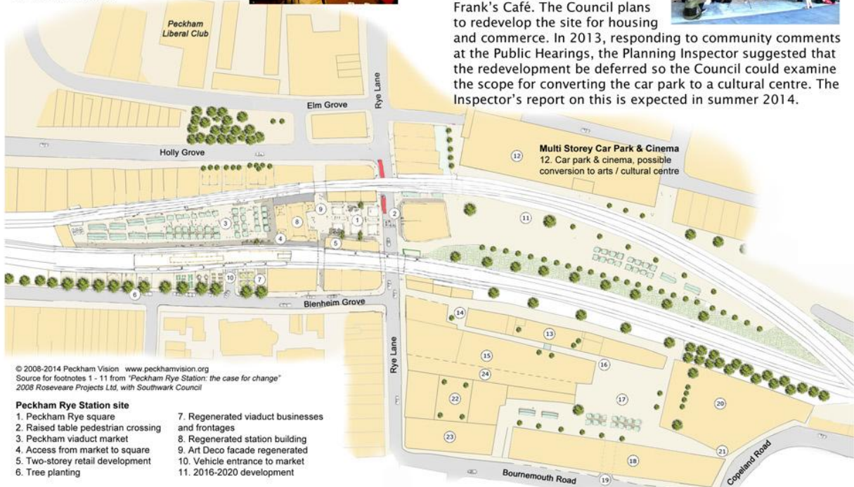
Source for footnotes 1 - 11 from "Peckham Rye Station: the case for change" 2008 Roseveare Projects Ltd, with Southwark Council