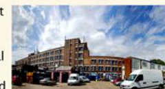
v.02 www.peckhamvision.org

This site was saved from the threat of demolition for a tram depot, through community action several years ago. The alternative proposal was rehabilitation of historic buildings integrated with new build creating linked squares and courtyards. This organic development is taking shape. The site's potential as a culture and leisure destination is being realised.