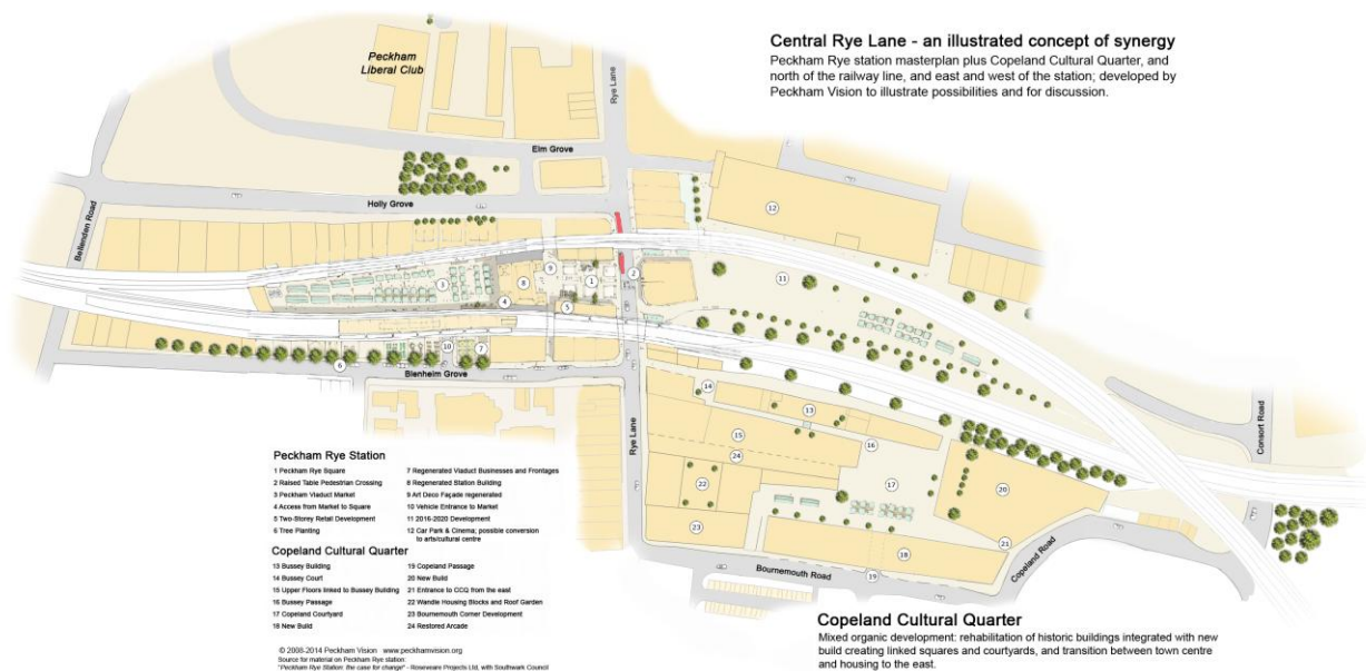
MAP 1. Peckham Vision illustrative masterplan idea for central Rye Lane

It formed in 2006 in a local campaign for a review of the draft UDP plan to demolish and locate a tram depot on a large site, including the Copeland Industrial Park land, across the road to the south east of Peckham Rye station. In the course of the campaign, Peckham Vision took forward the work of the local residents' Rye Lane & Station Action Group and developed an integrated masterplan idea for the way in which the historic station and the large area of Network Rail land around it linked with the Copeland site. As this central area of Peckham around the station began to realise its potential as a new and growing cluster of creative and cultural enterprises, partly stimulated by the Peckham Vision campaign, the remaining development sites adjacent to the north of the Network Rail land were incorporated into Peckham Vision's integrated masterplan idea. Map 1 is a recent version. This is in continuing development as an aid for information, community education and discussion as in the display panel, copy at Annex A, which is in the Peckham Vision mobile exhibition.