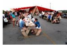
B3. Frank's Café on the top floor of the multi storey car park – breathtaking views of central London.