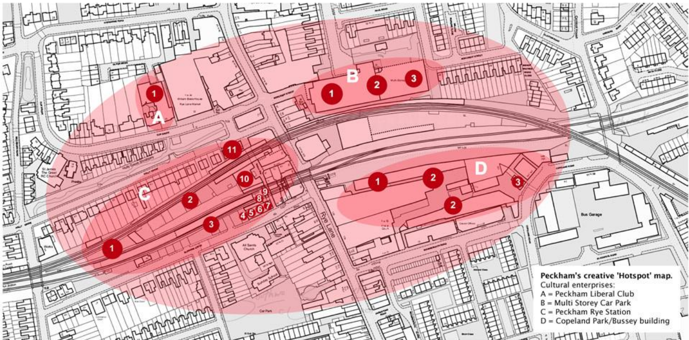
Peckham's creative 'Hotspot' map. Cultural enterprises: A = Peckham Liberal Club B = Multi Storey Car Park C = Peckham Rye Station D = Copeland Park/Bussey building