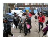
D2. Copeland Park, home to the Bussey building and other buildings with a variety of creative and cultural uses.