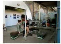
C2. Sassoon Gallery and Peckham Springs – the popular hang-out, showcasing new artists' work.