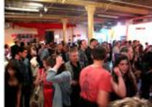
D1. Bussey building now thriving with the CLF Art Café and other multiple uses e.g. music, theatre, performance venues & art studios.